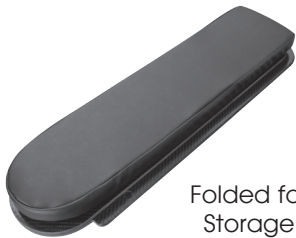
Folded for Storage